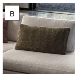
B CUSCINO PILLOW