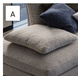
A BRACCIOLO ARMREST

The Hector model is originally presented without armrests. It is possible to use the backrest pillow art. HECCPR70 both as a cushion and as an optional armrest.